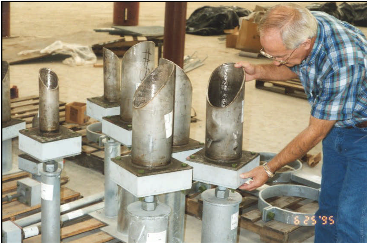
Varying shaped Phenonic Blocks for use in Cryogenic Supports